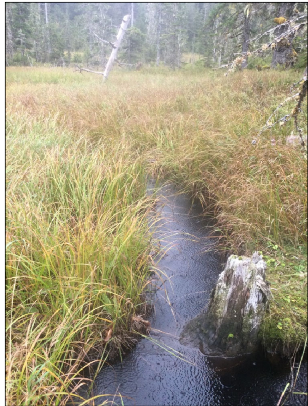
Figure 2.—Backwatered channel at waypoint 1826.