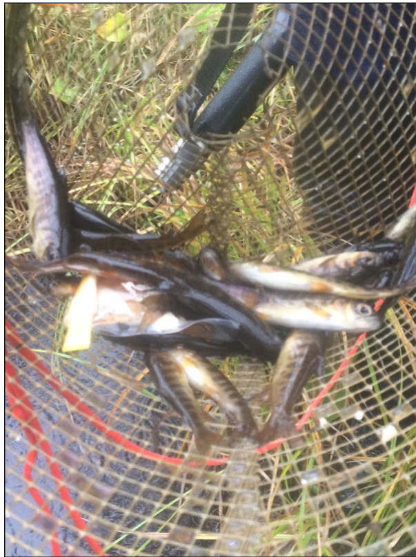
Figure 1.—Juvenile coho salmon captured at waypoint 1826.